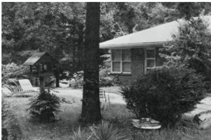
The exterior of the Ra room: the door and corner windows are part of the outside of the room in which the Ra sessions have taken place since January 1981. ( Photo taken June 9, 1982. )