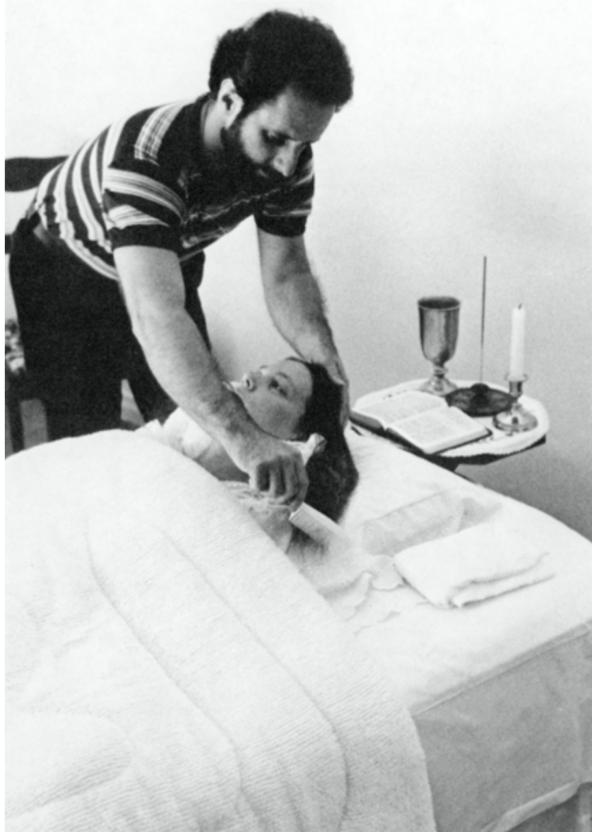
RA, Session No. 69, August 29, 1981: "At this particular working there is some slight interference with the contact due to the hair of the instrument. We may suggest the combing of this antenna-like material into a more orderly configuration prior to the working." ( Photo taken June 9, 1982. )