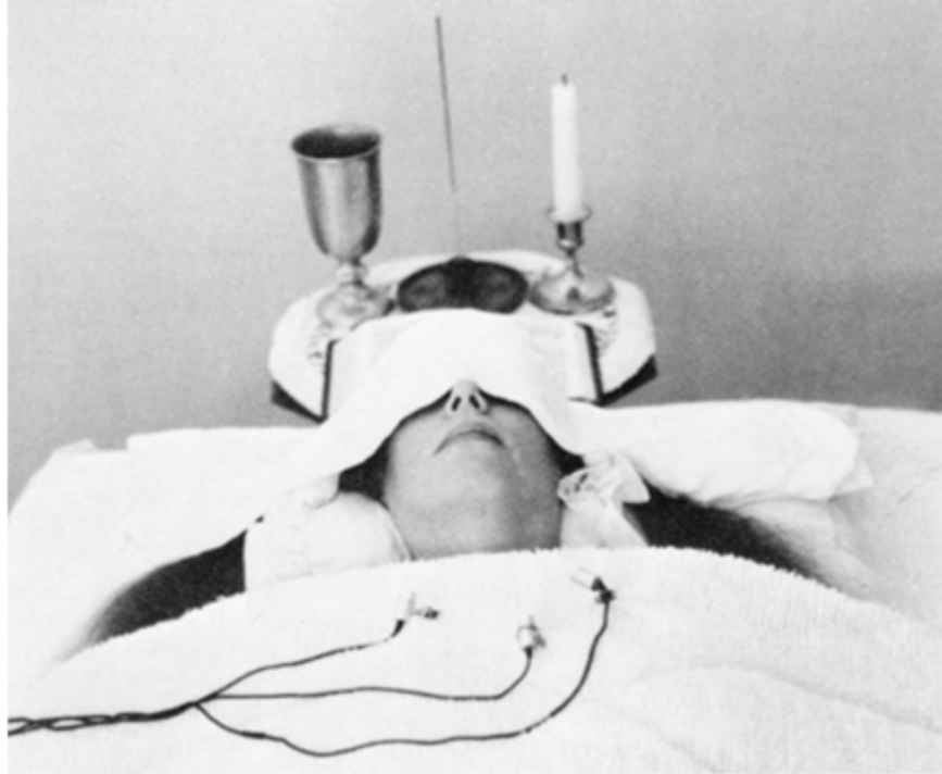
RA, Session No. 2, January 20, 1981: "The instrument would be strengthened by the wearing of a white robe. The instrument shall be covered and prone, the eyes covered." (Photo taken June 9, 1982.)